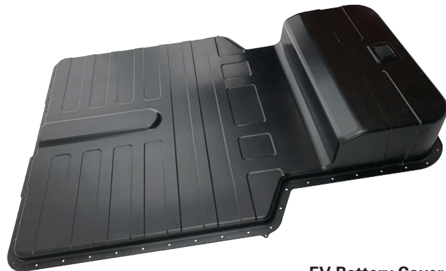
EV Battery Cover

More and more OEMs are replacing steel and aluminum battery enclosures with IDI's Flamevex TM composites. By doing so, they can eliminate up to 35% of the housing weight and realize cost reductions of up to 65% by reducing secondary operations.