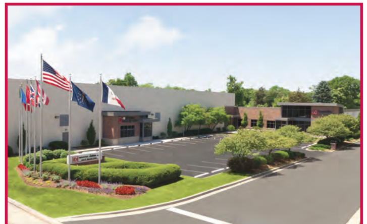
IDI Global Headquarters