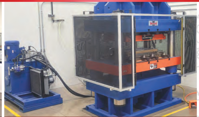
Part Prototyping And Testing