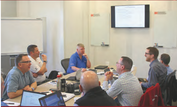
The 3i Composites Technology Conference Center