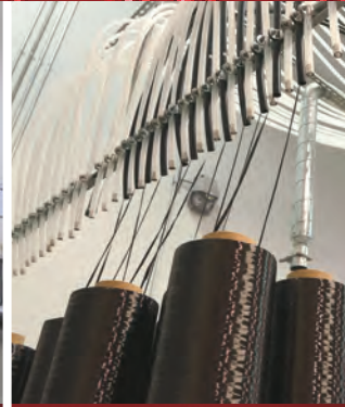
Material Development And T