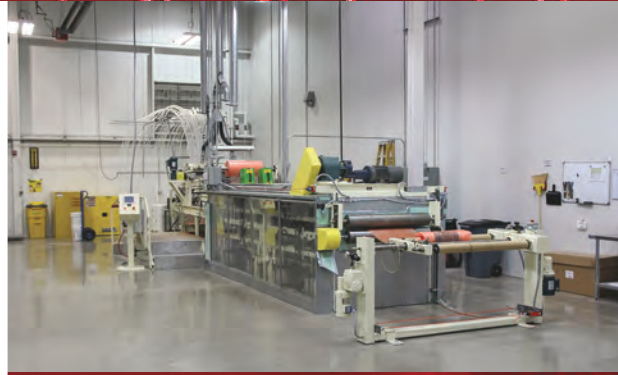
SMC Machine Customized For New Product Development