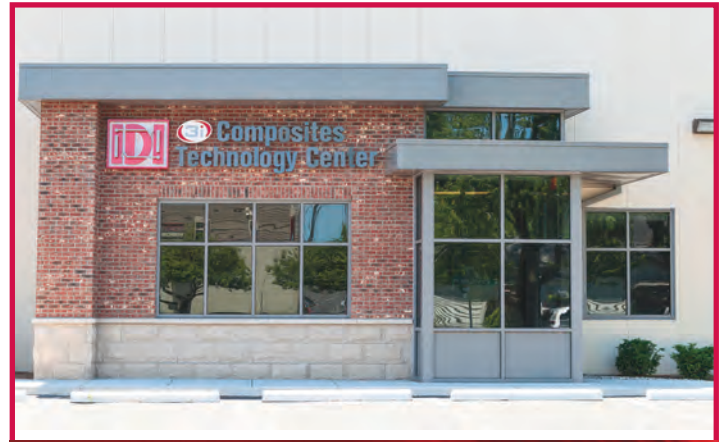
The IDI 3i Composites Technology Center

The IDI 3i Composites Technology Center's mission is to design, develop and manufacture thermoset composite compounds for innovative customers seeking to go beyond the value limitations of conventional materials.